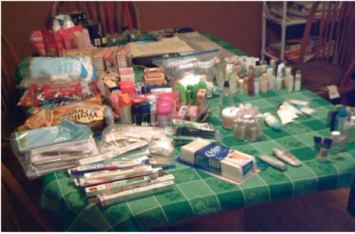
AWC made a generous donation of many useful, personal products to our troops in Afghanistan.